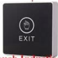
Touch Induction Door Release button EB-20B