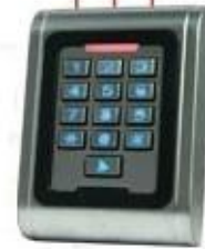
Single Door Access control Keypad