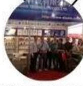
2013 Shenzhen Fair