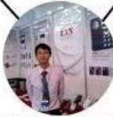
2012 Shenyang Fair