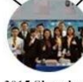
2015 Shenzhen Fair