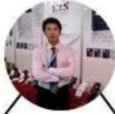
2012 Shenyang Fair