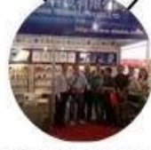
2013 Shenzhen Fair