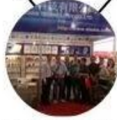
2013 Shenzhen Fair