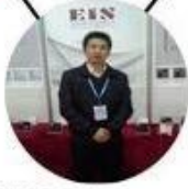
2013 Shenyang Fair