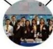
2015 Shenzhen Fair