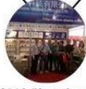
2013 Shenzhen Fair