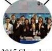
2015 Shenzhen Fair