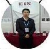
2013 Shenyang Fair