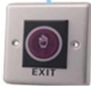
Door release button