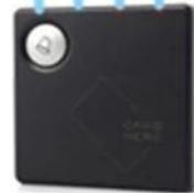
Access control keypad