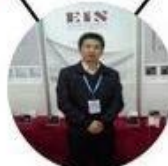
2013 Shenyang Fair