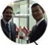
2011 Brazil Fair