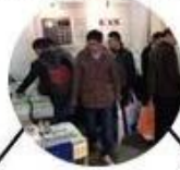
2013 Jinan Fair