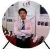
2012 Shenyang Fair