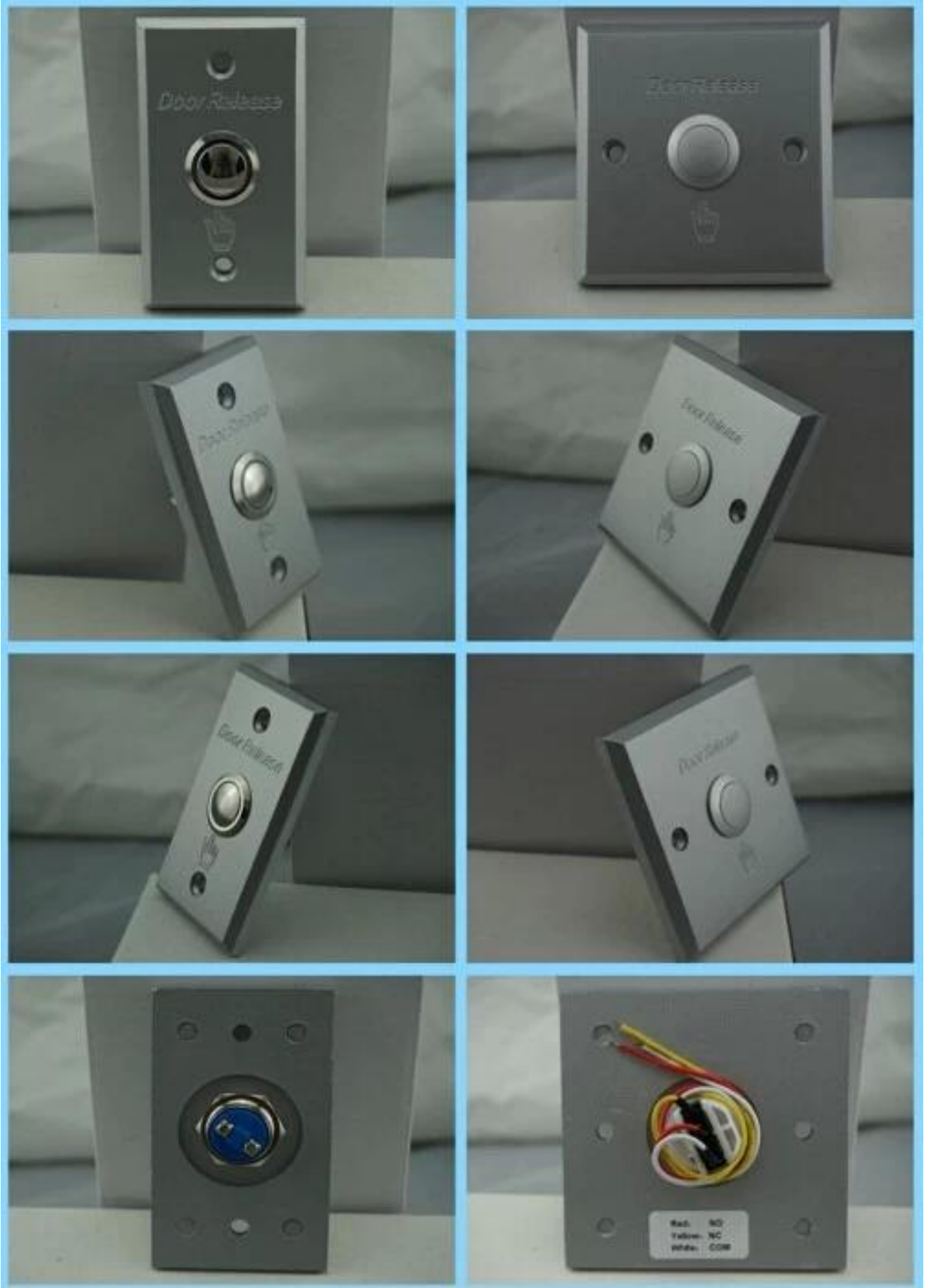
Door button lock release sa mga materyal ng metal at hindi