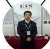
2013 Shenyang Fair