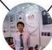
2012 Shenyang Fair