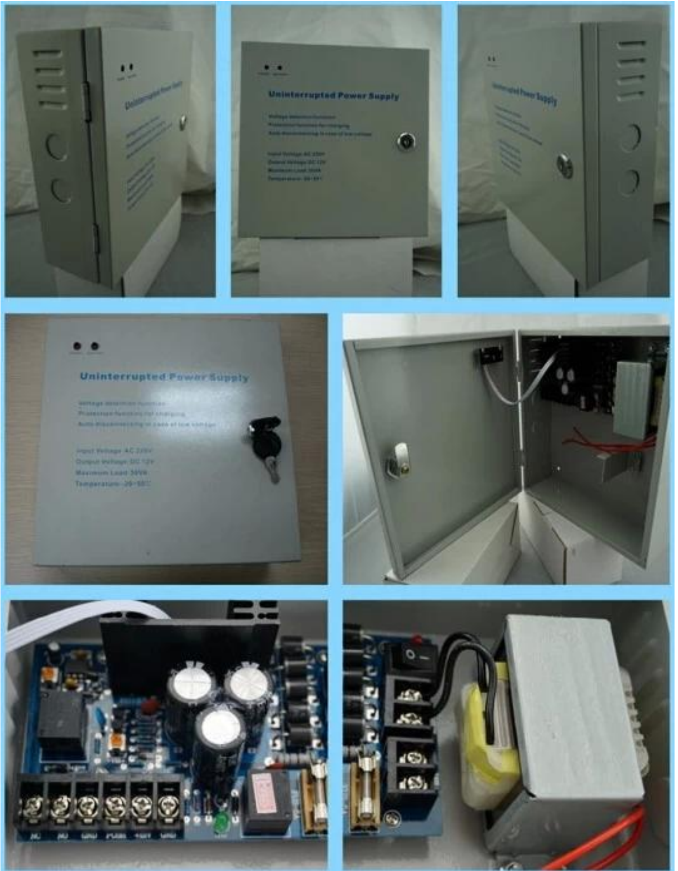
Waterproof uninterruptible power supply (ups) ay variable 12v power supply china ginawa at ginamit sa control system pinto access at alarma system.