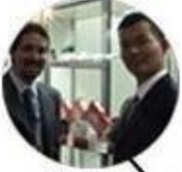
2011 Brazil Fair