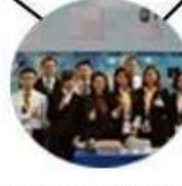
2015 Shenzhen Fair