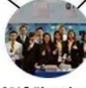
2015 Shenzhen Fair