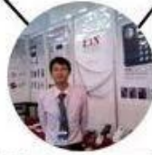
2012 Shenyang Fair