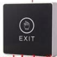
Touch Induction Door Release button EB-20B