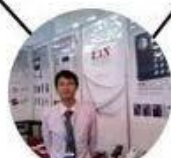
2012 Shenyang Fair