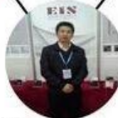
2013 Shenyang Fair