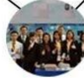
2015 Shenzhen Fair