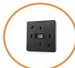
Black color card reader back