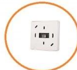
White color card reader back

The card reader proximity outdoor with 125khz keypad rfid reader modeule software.