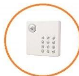
White color card reader