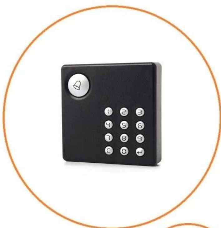
Waterproof WG card reader