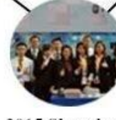
2015 Shenzhen Fair