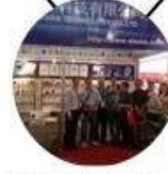
2013 Shenzhen Fair