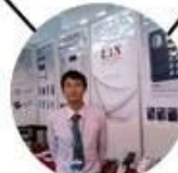
2012 Shenyang Fair