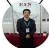
2013 Shenyang Fair