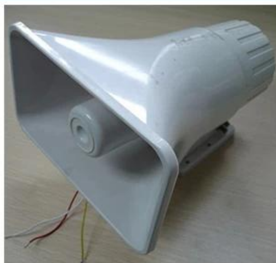
Electromechanical siren alarm 120 db outdoor siren with hight