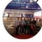
2013 Shenzhen Fair