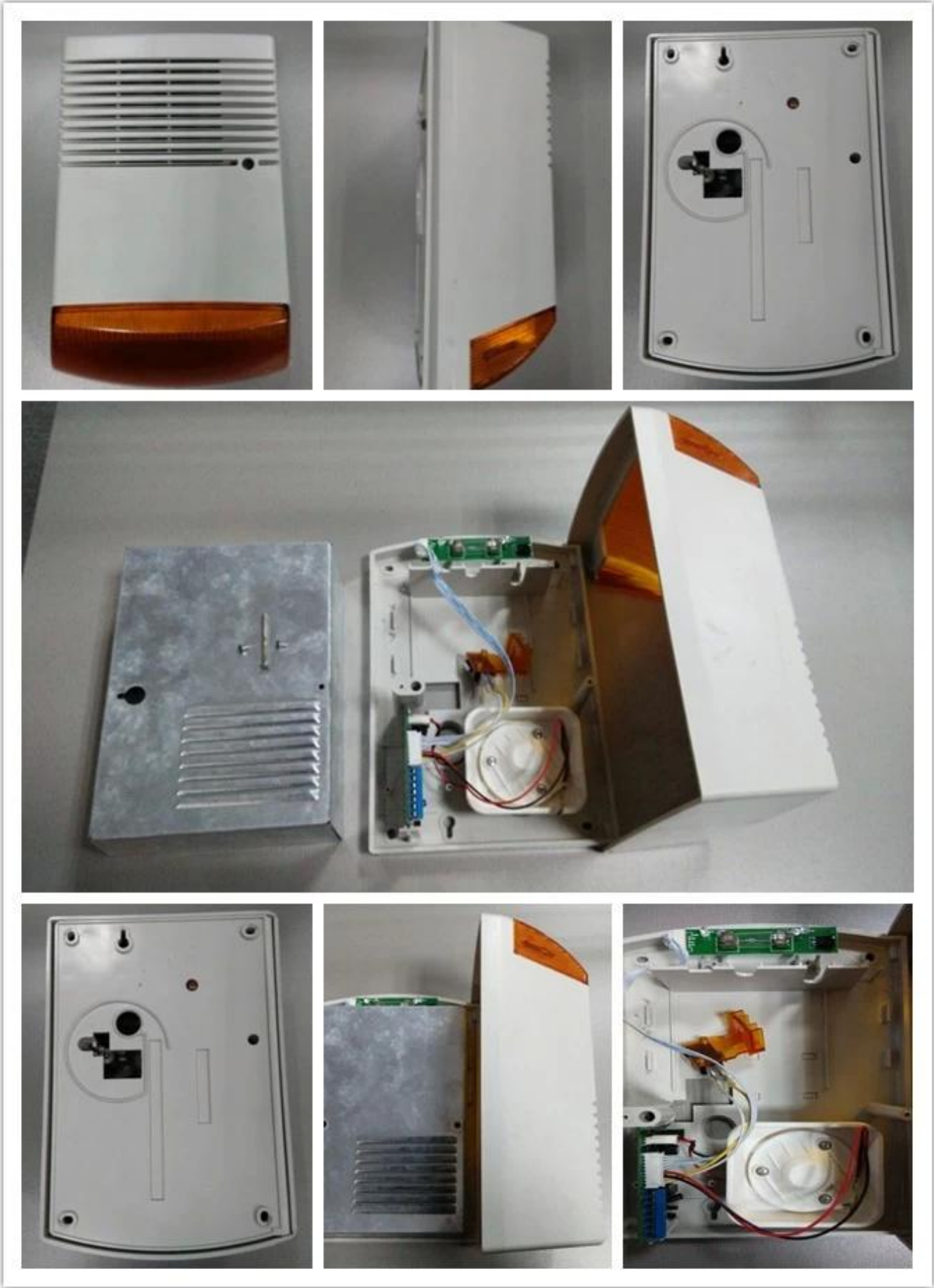
The electronic outdoor alarm siren is the strobe red horn with