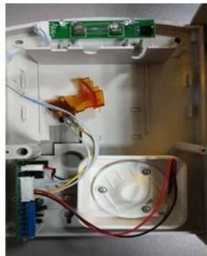
The electronic outdoor alarm siren is the strobe red horn with