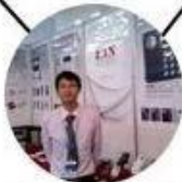
2013 Shenyang Fair