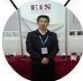
2013 Shenzhen Fair