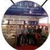
2015 Shenzhen Fair