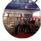
2013 Shenzhen Fair