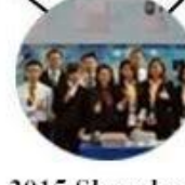
2015 Shenzhen Fair