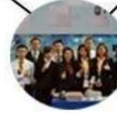
2015 Shenzhen Fair