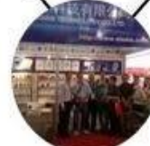
2013 Shenzhen Fair