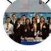
2015 Shenzhen Fair