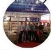
2013 Shenzhen Fair