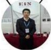
2013 Shenyang Fair