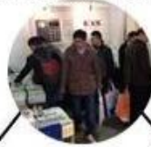
2013 Jinan Fair