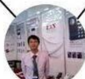
2012 Shenyang Fair