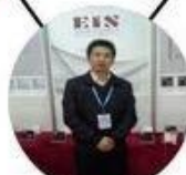
2013 Shenyang Fair