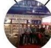
2013 Shenzhen Fair