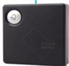
Card reader EA-93