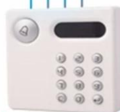
Access control keypad EA-83DK