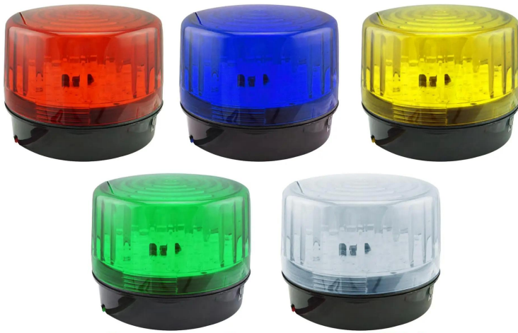
5 types color accept OEM