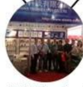
2013 Shenzhen Fair