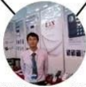
2012 Shenyang Fair