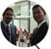
2011 Brazil Fair