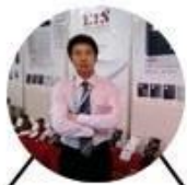
2012 Shenyang Fair