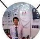
2012 Shenyang Fair