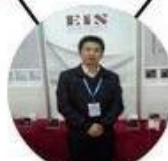
2013 Shenyang Fair