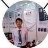
2012 Shenyang Fair