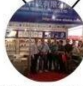
2013 Shenzhen Fair