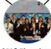
2015 Shenzhen Fair