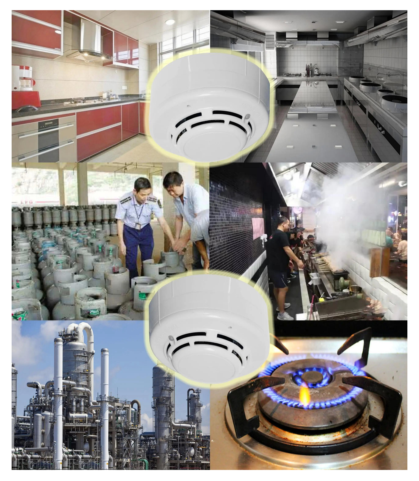
This kind of wired gas detector is suitable for Kitchen, barbecue, charcoal heating, gas station etc.