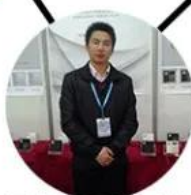
2013 shen yang Fair