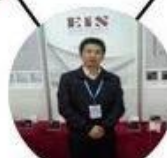
2013 Shenyang Fair