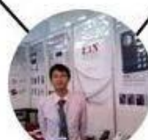
2012 Shenyang Fair