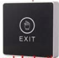
Touch Induction Door Release button EB-20B