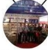
2013 Shenzhen Fair