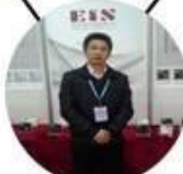
2013 Shenzhen Fair