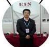
2013 Shenzhen Fair