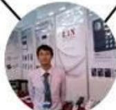
2013 Shenyang Fair