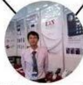
2012 Shenyang Fair