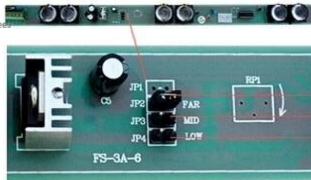
3 warning distance adjustable map

The bracket adopts the latest sliding cover to be designed, and the installation is more convenient. Disassembly more secure.