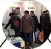
2013 Shenzhen Fair