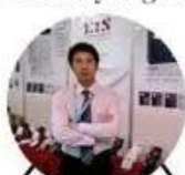
2013 Jinan Fair