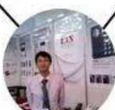
2013 Shenyang Fair