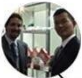
2012 Shenyang Fair