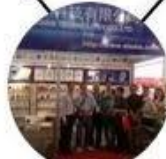
2015 Shenzhen Fair