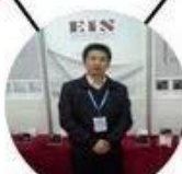
2013 Shenzhen Fair