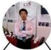
2013 Jinan Fair