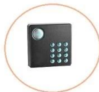
WG card reader