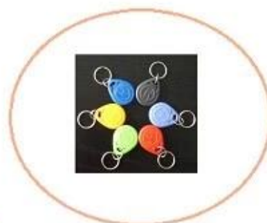
Key tag colors