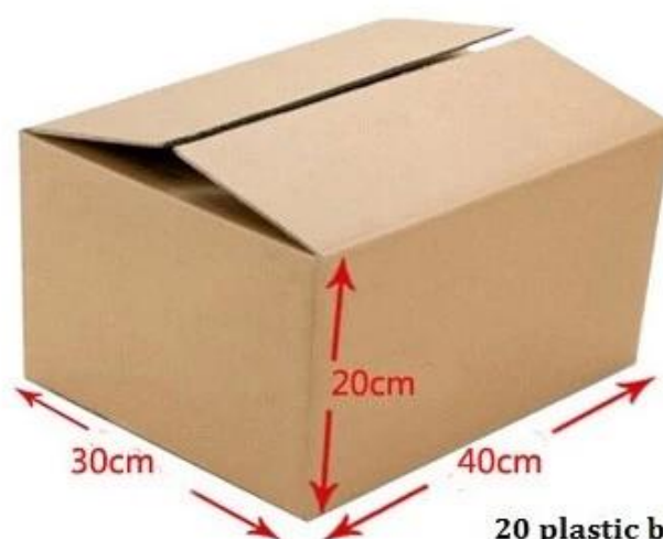
20 plastic bags/carton