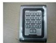
front of the reader