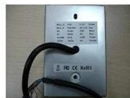
Back of the reader