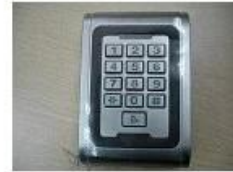
front of the reader