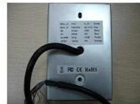
Back of the reader