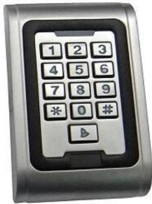
Single door access control (Waterproof ,LED light ,metal case)

Door access control reader keypad is the metal case access management controller box for door.