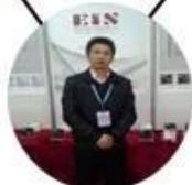
2013 Shenyang Fair