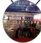
2013 Shenzhen Fair