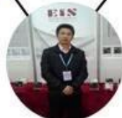
2013 Shenyang Fair