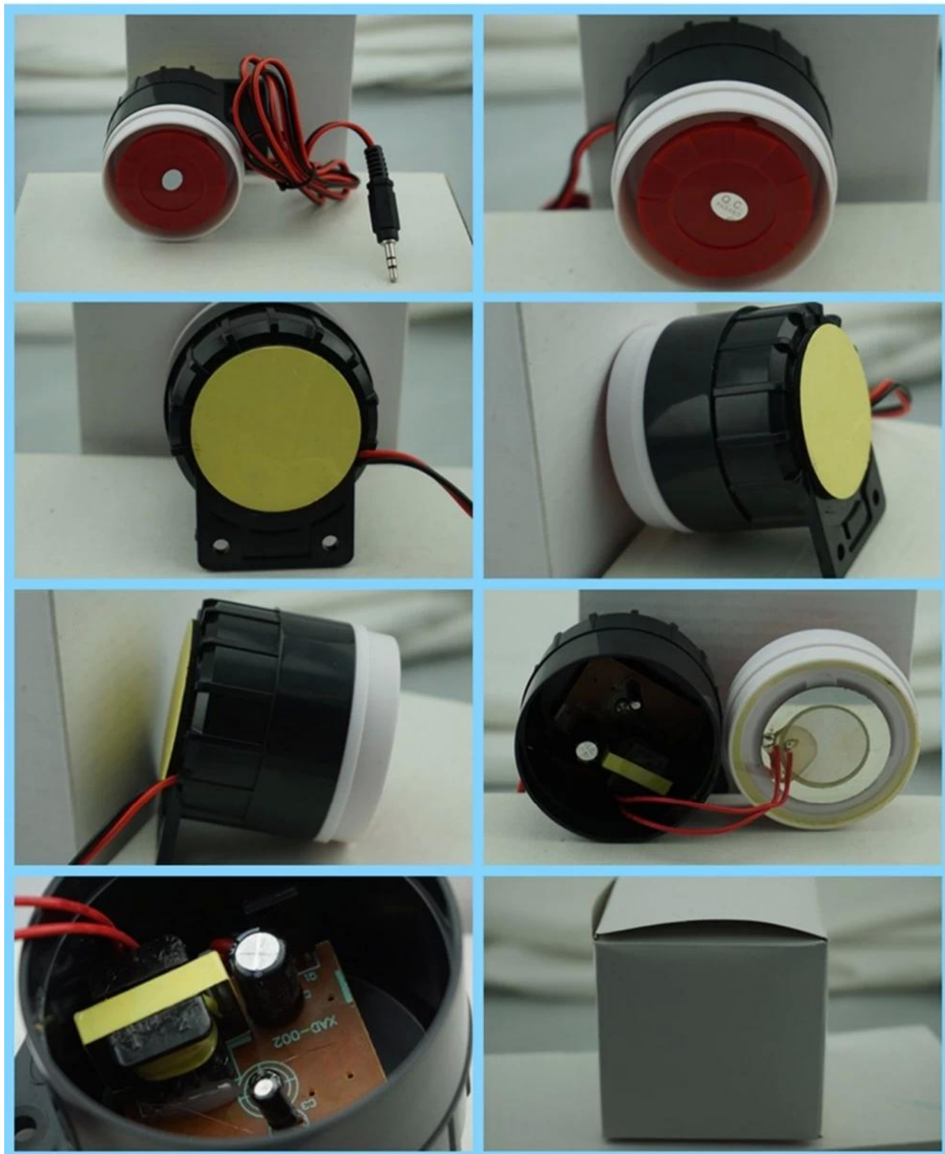
The emergency alarm small electric siren EB-163 without light