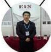
2013 Shenyang Fair