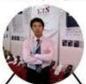
2012 Shenyang Fair