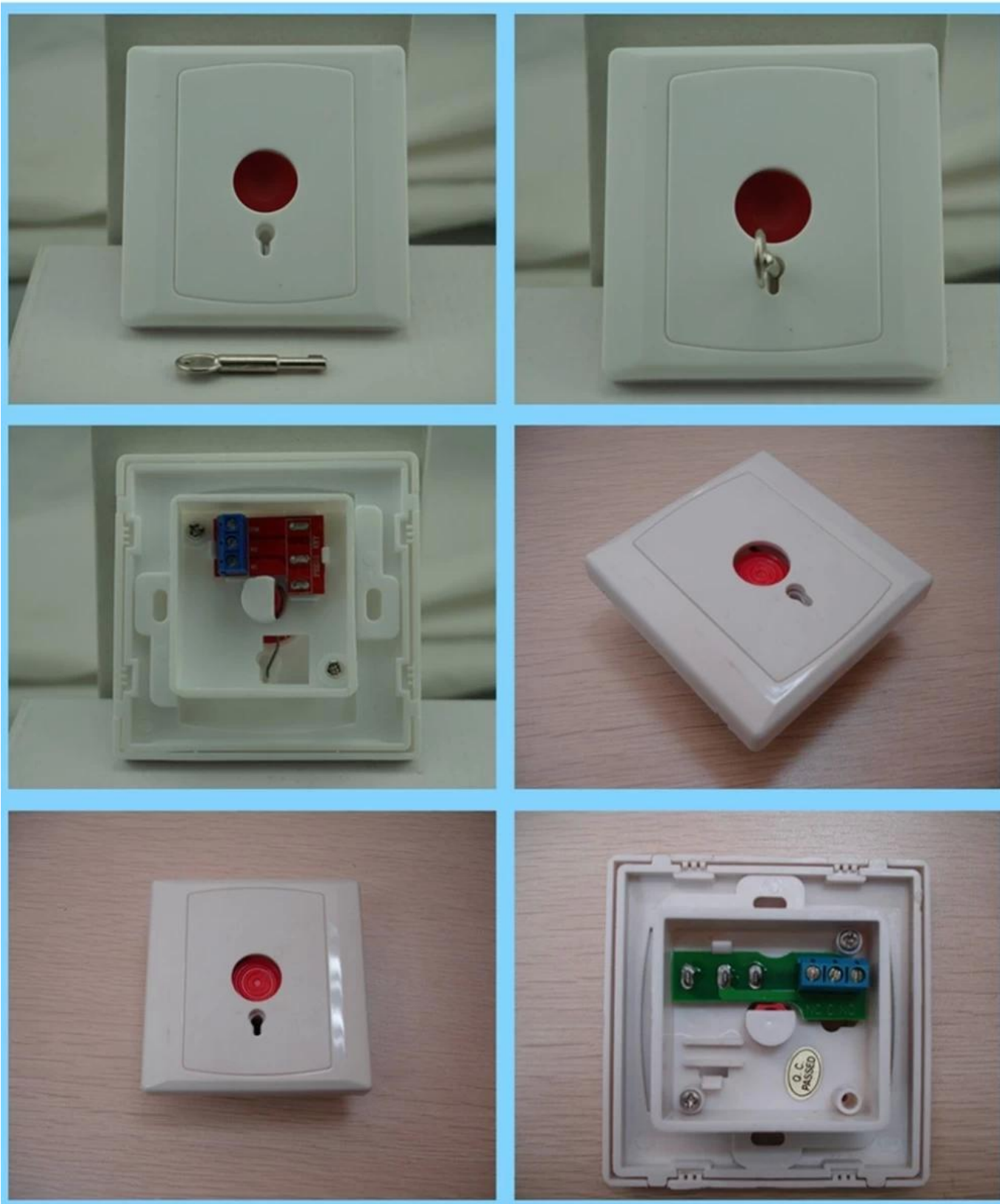
The key rest alarm panic button used with the access control system